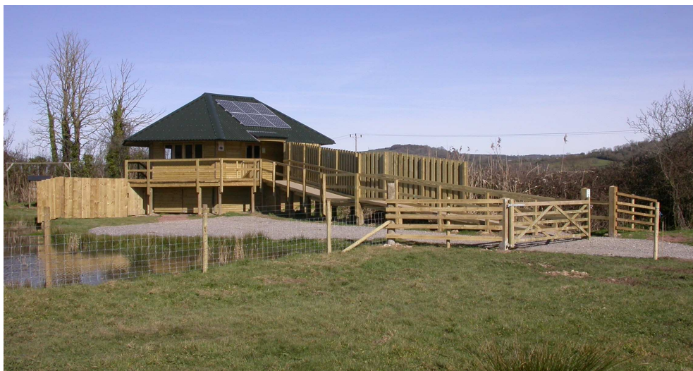
Stafford Marsh Field Studies Building, on the Axe Estuary