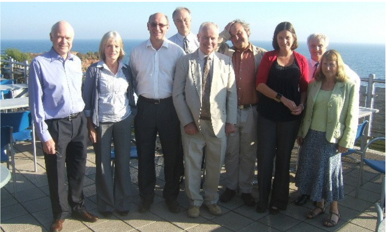
Presenters at the Enterprising Coastal Transport Conference

With the support of Severn Link, the Dorset AONB & Jurassic Coast Partnership and the Somerset Towns Forum