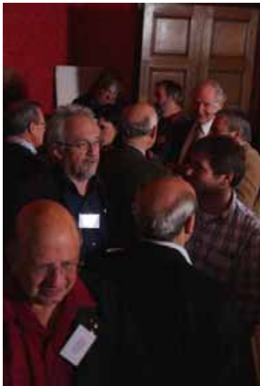
Catching up over coffee

"Where is the agenda about rural culture, values, social change etc dealt with? What is our social vision for the future of the countryside? E.g. what is our attitude to social diversity/incomers etc? A strength or a problem? How do we help people change/move on in their feelings and attitudes to what the countryside 'should' be?"