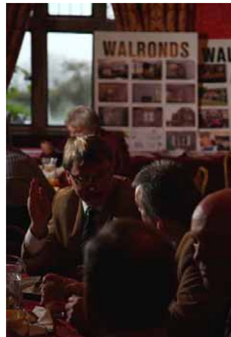
Networking over lunch

“Seminar with grant funding agencies giving advice on